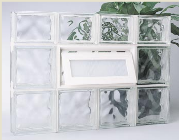
DECORA® Pattern, with its trademark wavy undulations, provides maximum light transmission with subtle visual distortion.

Choose from three distinct patterns, each offering its own unique style, degree of light transmission and privacy. Perfect for replacement or new-window and small-partition applications. Prefabricated panels are available with or without vents.