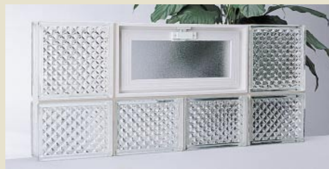
DELPHI® Pattern, with prismatic diamond design, provides moderate light transmission with maximum privacy.