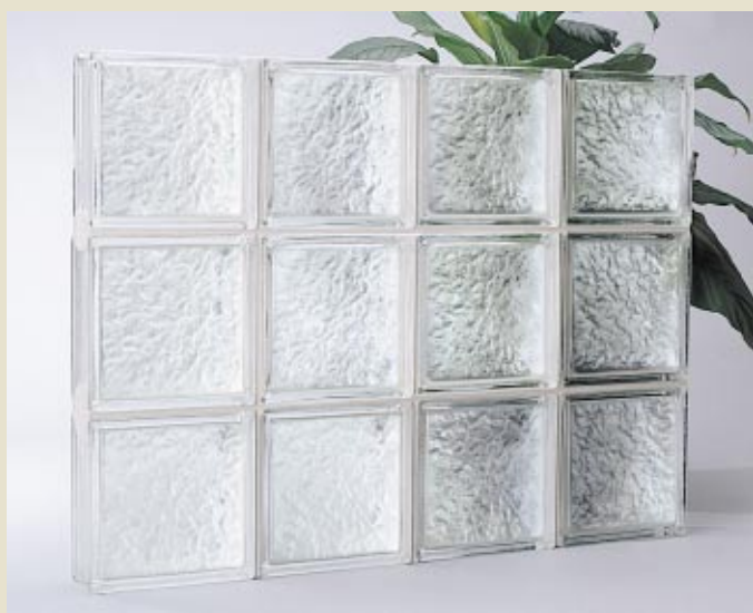
IceScapes® Non-Directional Pattern lets light in without sacrificing privacy. Maximum light transmission with a maximum degree of privacy.